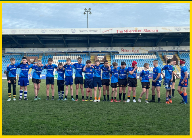
Above: Malet's Year 7 Boys rugby team. Left: Malet's Year 9 Girls team celebrate their win.