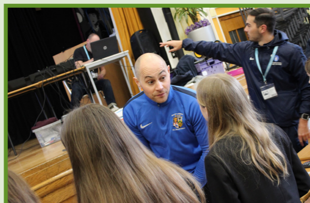
Year 8 pupils become stock traders for the day during their session with Innovative Enterprise.