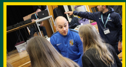
National Careers Week