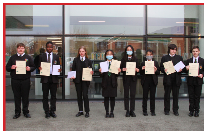
Malet Lambert pupils with their certificates after taking part in the Top of the Bench Competition.

The second task was to research and then present information on the challenges associated with producing electric car batteries and to outline other potential energy sources.