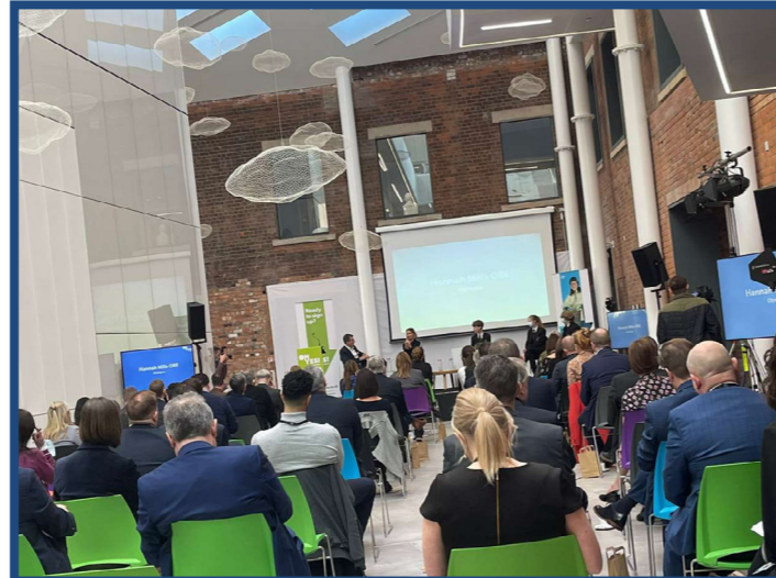
Pupils at the Oh Yes! Net Zero Campaign launch attended a Q&A with COP26 President, Alok Sharma.

Whilst attending the event, Malet Lambert pupils to part in a range of activities, including question panels with the visiting speakers, including Mr Sharma, a recycling workshop with Reckitt, and the chance to learn about the different sustainability efforts in around Hull.