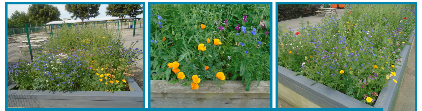
Some of the flowers begin to blossom, as part of Malet Lambert's contribution to the Superbloom project.

Last term, we shared that our pupils and staff were taking part in the nationwide event "Superbloom" in celebration of The Queen's Platinum Jubilee. We are happy to report that the seeds that were planted by our pupils and staff have burst into bloom, displaying a range of colour and flower types.