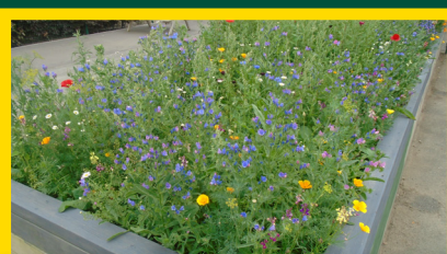
Superbloom at Malet