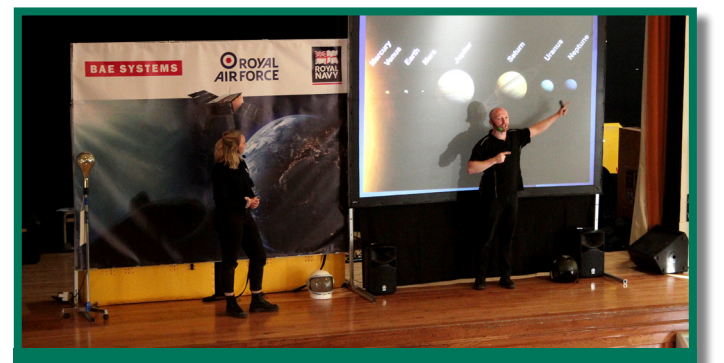
Businesses and providers deliver talks and workshops to pupils as they consider their post-GCSE options,

Our Careers provision can offer advice to pupils on the options available to them upon completing their exams. They can also point them towards relevant and informative resources to better help them when considering their future pathways. We also plan to hold another careers/colleges event later in the year.