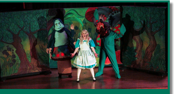
M&M Theatre Productions came into Malet Lambert to perform a rendition of Alice in Wonderland.

In the new half term and beyond, pupils completing the award can look forward to more opportunities to discover and even partake in more artistic disciplines.